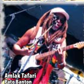
Amlak Tafari Pato Banton