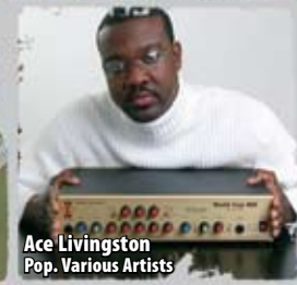
Ace Livingston Pop. Various Artists