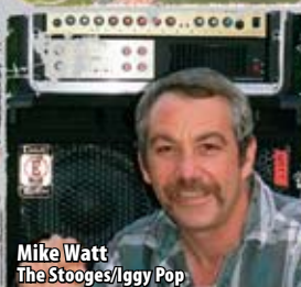
Mike Watt The Stooges/Iggy Pop