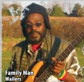
Family Man Wailers