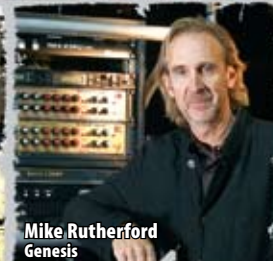
Mike Rutherford Genesis