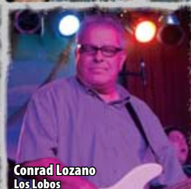
Conrad Lozano Los Lobos