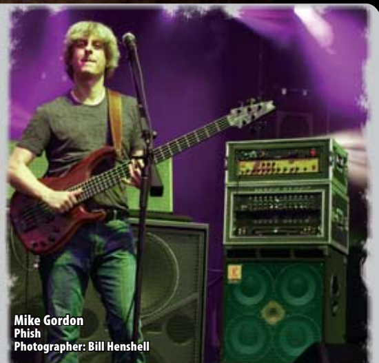
Mike Gordon Phish