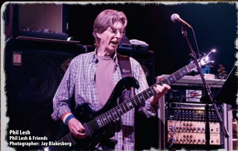
Phil Lesh Phil Lesh & Friends